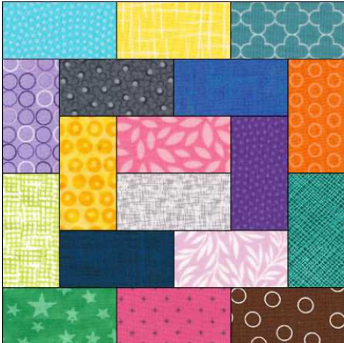
Potato Chip block Version 2