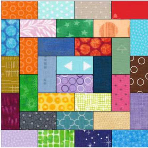
Potato Chip block Version 1